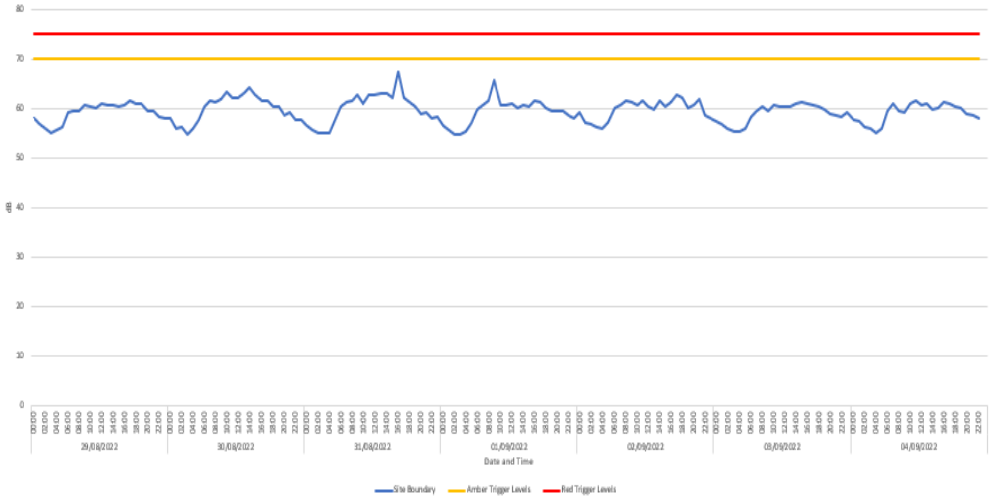
Figure 1. Noise Monitoring (29.08.22-04.09.22)