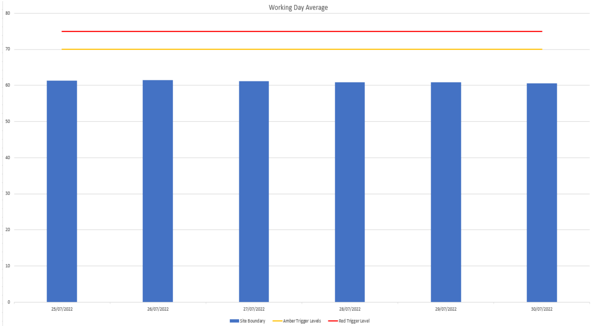
Figure 2. Noise Monitoring Working Hour Averages (25.07.22-31.07.22) – No exceedances.