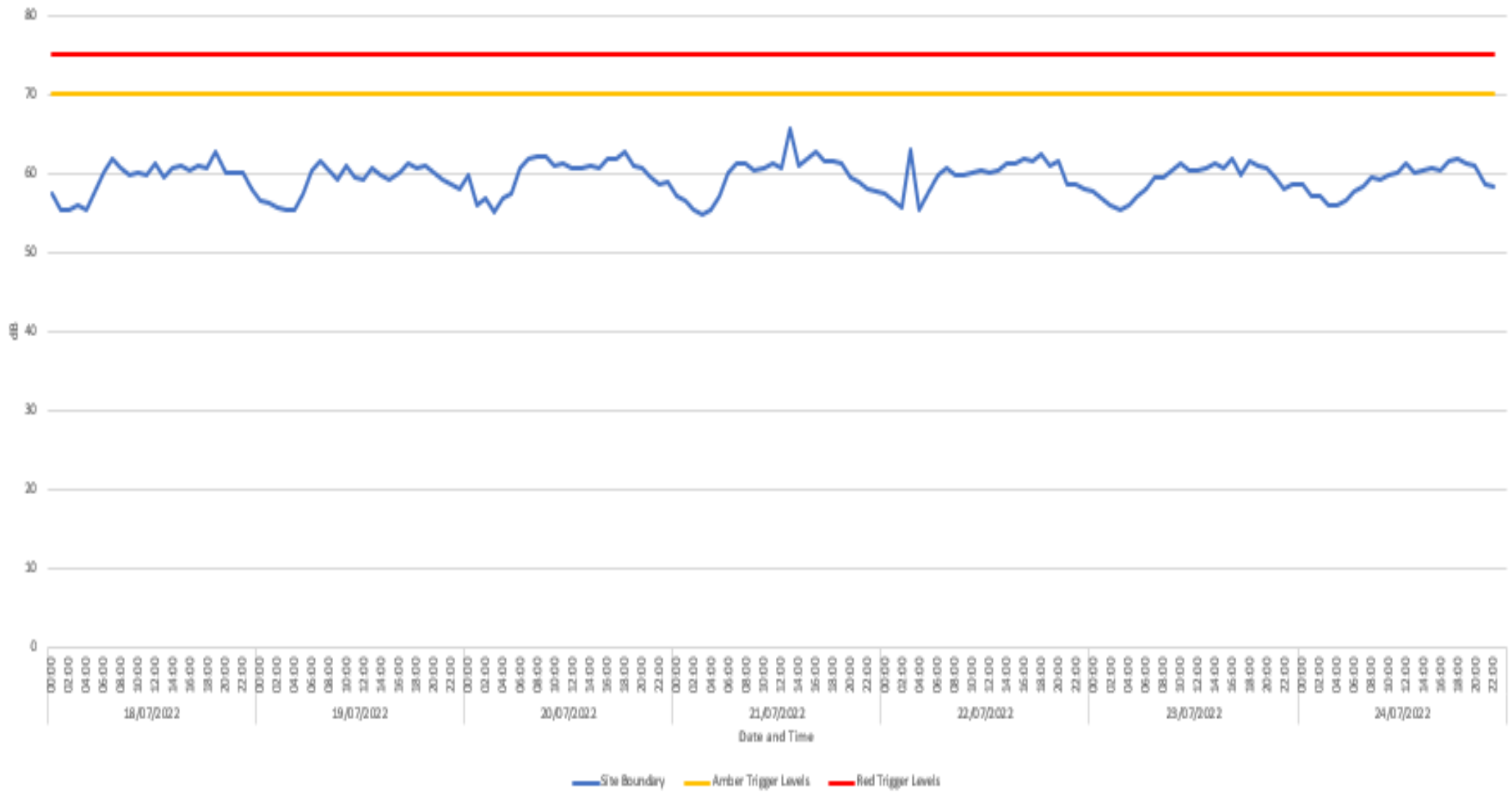
Figure 1. Noise Monitoring (18.07.22-24.07.22)