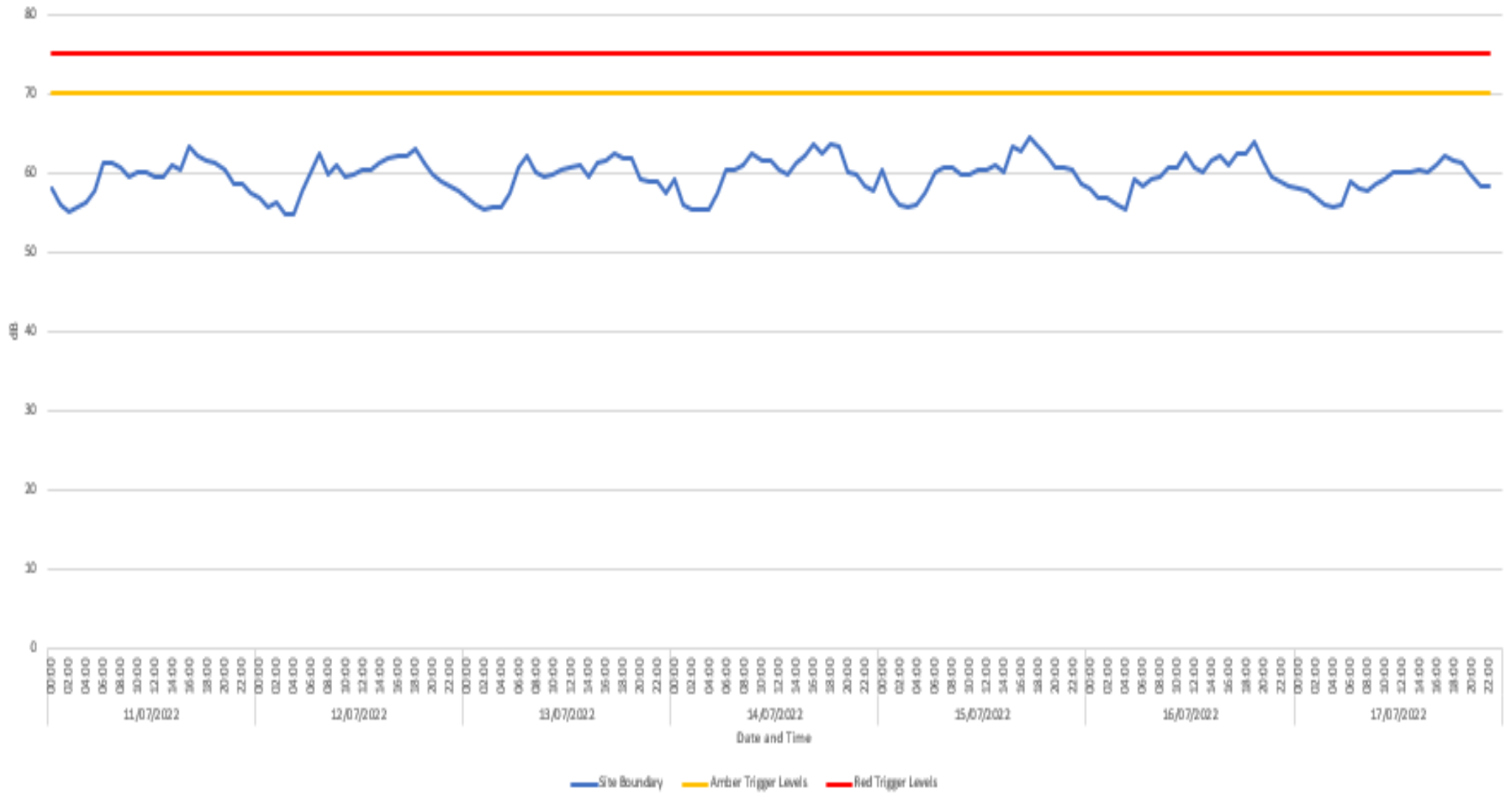
Figure 1. Noise Monitoring (11.07.22-17.07.22)