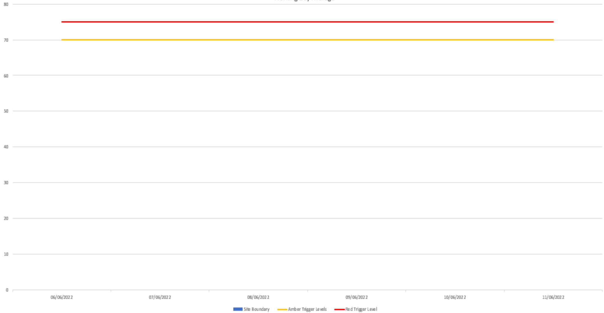
Figure 2. Noise Monitoring Working Hour Averages (06.06.22-15.06.22) – No exceedances.